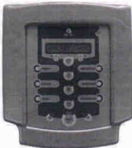
QRS-101 Control Unit